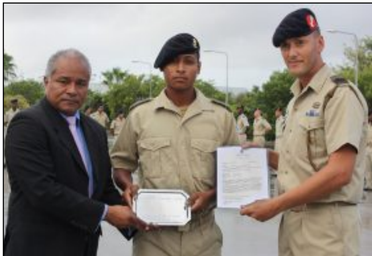
cu exito, a forma parti di e festividad importante pa e candidatonan cu a aproba aki.